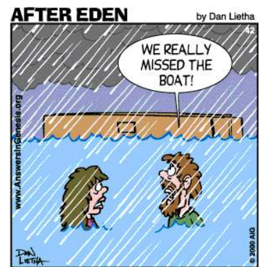
The undocumented first use of this well-known phrase.